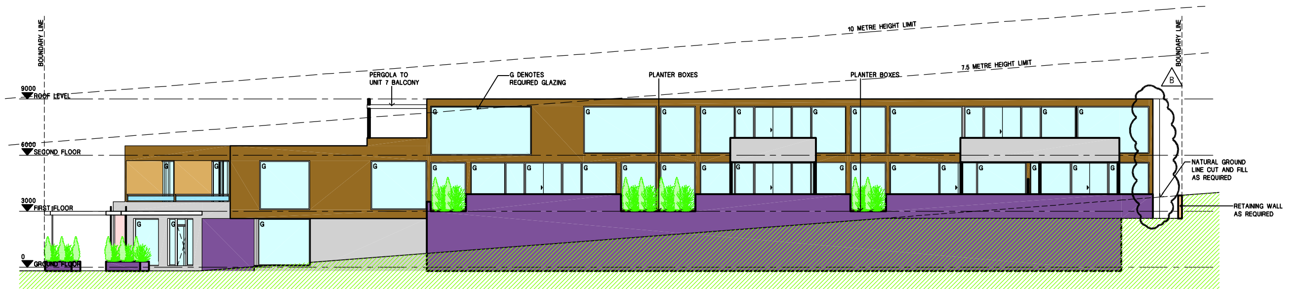
EAST ELEVATION SCALE 1:200